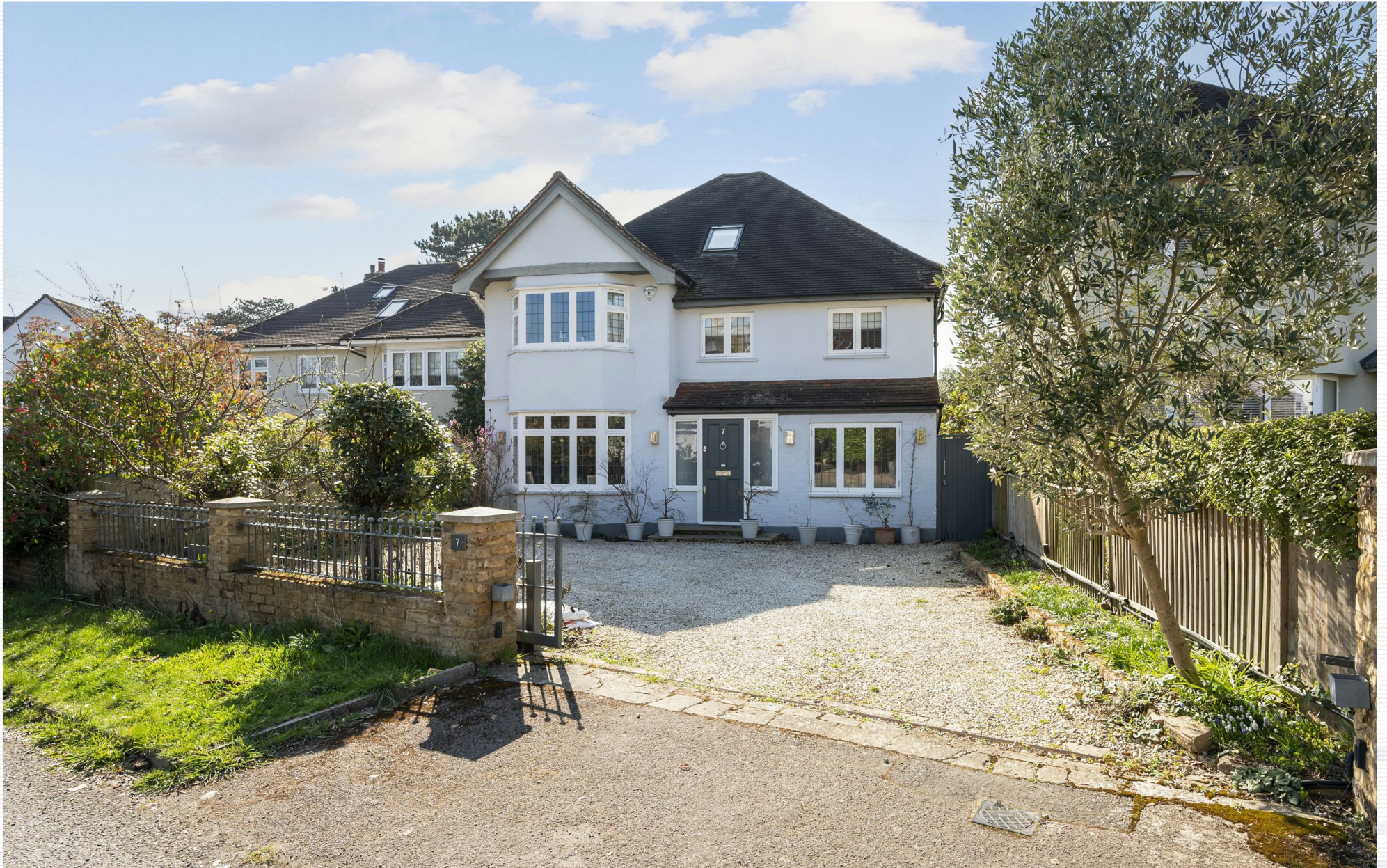
Lindisfarne Road, Wimbledon, SW20 0NW